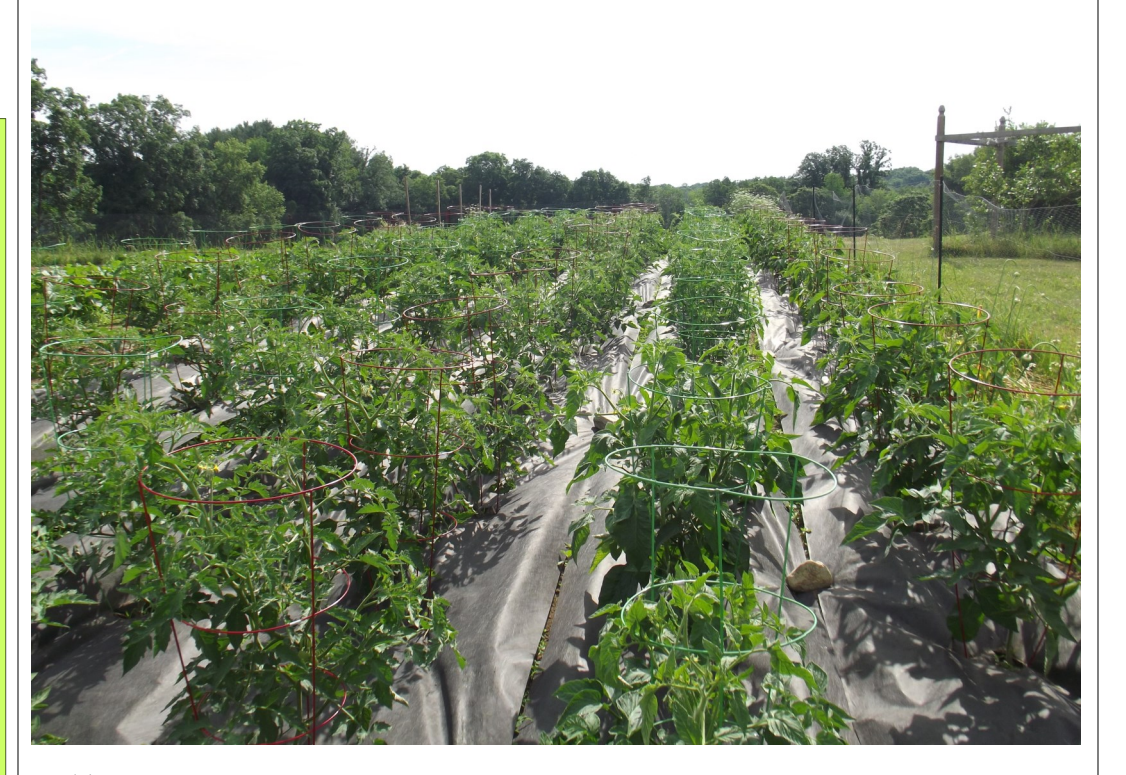
This tomato plantation represents a portion of our agricultural operations at the field station.

"Cultivation of American Chestnut seedlings at the field border also continues, with 15 of the originally planted seeds surviving ..."