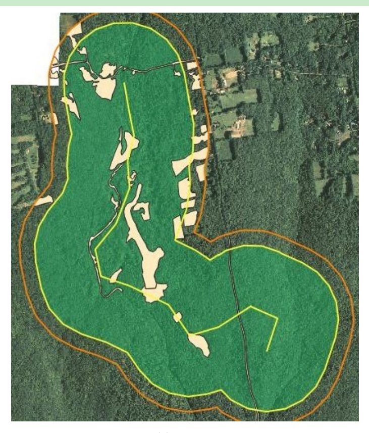
This study site in Harwinton, CT is heavily forested (green within yellow boundary) and only shows limited breaks in the forest canopy due to watercourses and human activity (cream).

Analysis continues in our study of how habitat fragmentation has affected the forest bird communities of Connecticut and Rhode