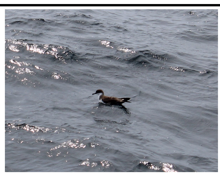
The Great Shearwater, a frequent summer visitor to the coast of eastern North America, breeds on only a few islands in the South Atlantic.