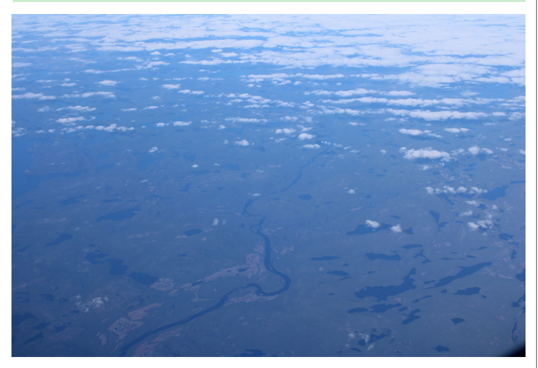
This aerial view of the coast of southern Labrador shows the last location on the continent where large numbers of migrating Eskimo Curlews staged.

With a single likely sighting of an Eskimo Curlew (https://www.blogger.com/u/1/blog/post/edit/797768705412563017/8868109822920940020)